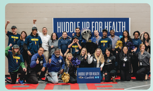
Nexus-Woodbourne received the "Huddle Up for Health" grant.

Carefirst BlueCross BlueShield and The Baltimore Ravens awarded Nexus-Woodbourne the "Huddle Up for Health" grant to enhance aftercare services. This enables Nexus-Woodbourne youth to return to their communities and continue to receive direct access to health and wellness resources, financial support, continued mental health care, and the ability to stay engaged with their peers and the agency care team.