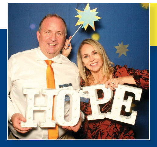
"Supporting Nexus is so worthwhile. The people are amazing, and I see the results of their work in the youth they serve." - Mervl

{}^*Names have been changed to maintain privacy